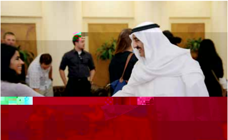
Speaker of the Kuwait National Assembly, Jassem Al-Kharafi, greets BC student

The major and its associated minor provide a well-integrated and rigorous program of study in languages, history, cultures, and politics of the many diverse societies where Islam is the majority religion or in which there are significant Muslim minorities.