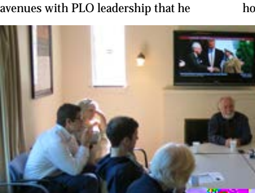
Israeli negotiator Yair Hirschfeld appeared at the Boisi Ce informal breakfast discussion with select faculty members

Yair Hirschfeld, an architect of the 1993 Oslo Accords between Israel and the Palestinian Liberation Organization (PLO), addressed a gathering of faculty and graduate students at an informal breakfast at the Boisi Center in September. Hirschfeld detailed the back-channel avenues with PLO leadership that he