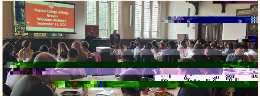
The 2022 Affinity Groups Welcome Luncheon