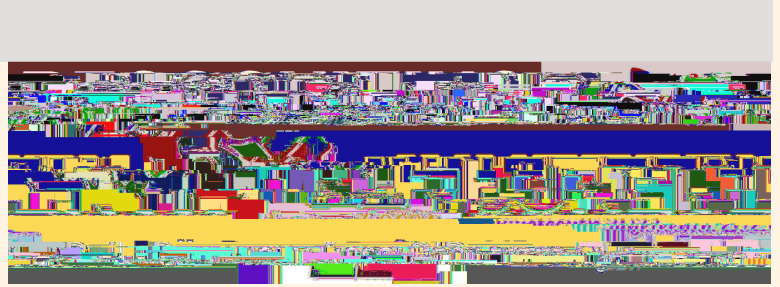
June 19, 2021, marked the first year in